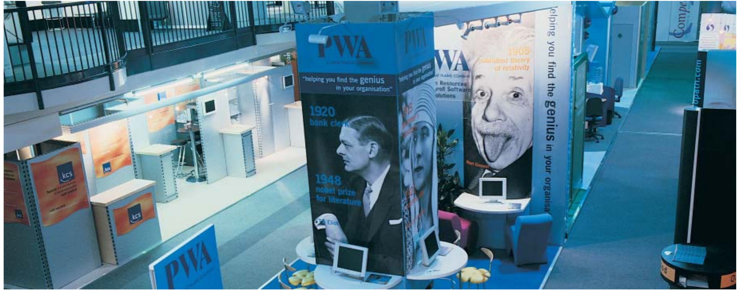
Two Halls offer eight thousand square metres of trade exhibition space. Each hall features a double-height area which provides space for custom-built stands.