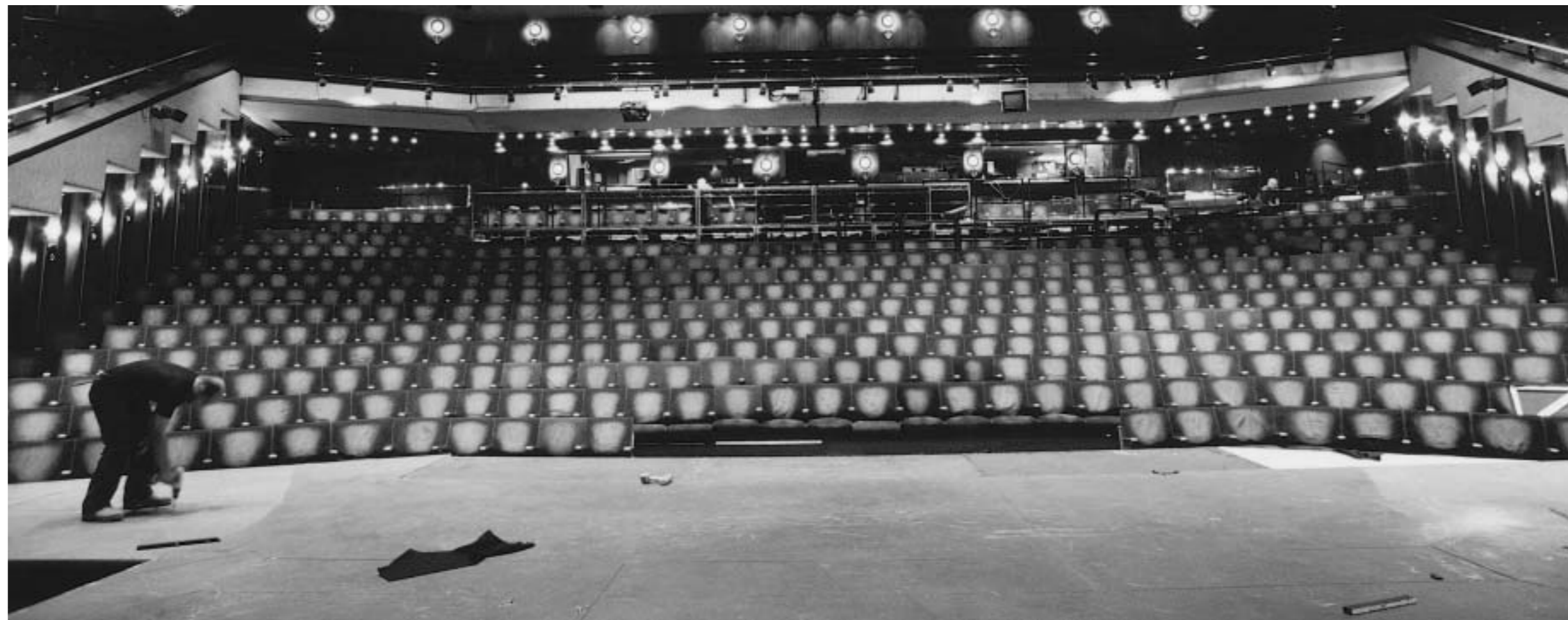
The world-renowned Barbican Theatre, (equipped with the highest fly-tower in Europe and a fourteen metre lorry lift) is ideal for large-scale events.