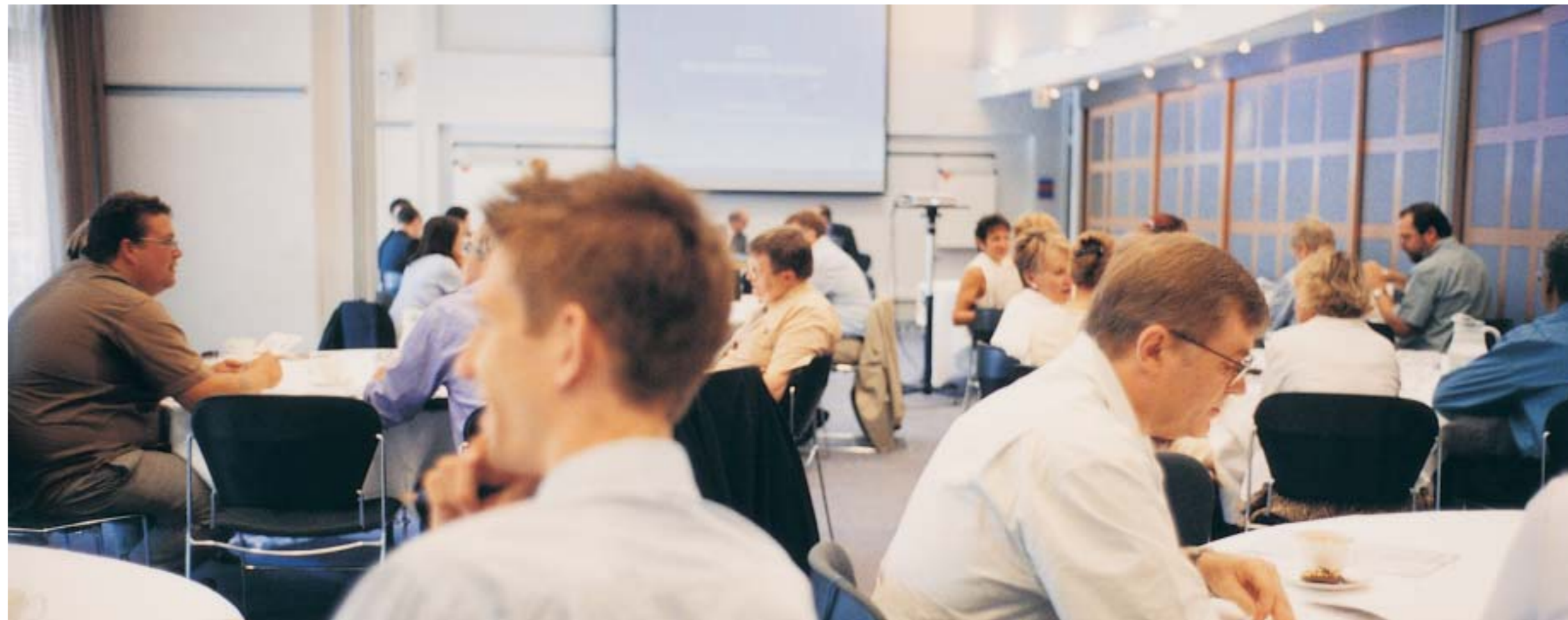
Two large flat-floored suites with sound-proof partition walls sub-divide into six smaller rooms accommodating ten to one hundred and seventy delegates, together with a dedicated boardroom with comfortable leather chairs.