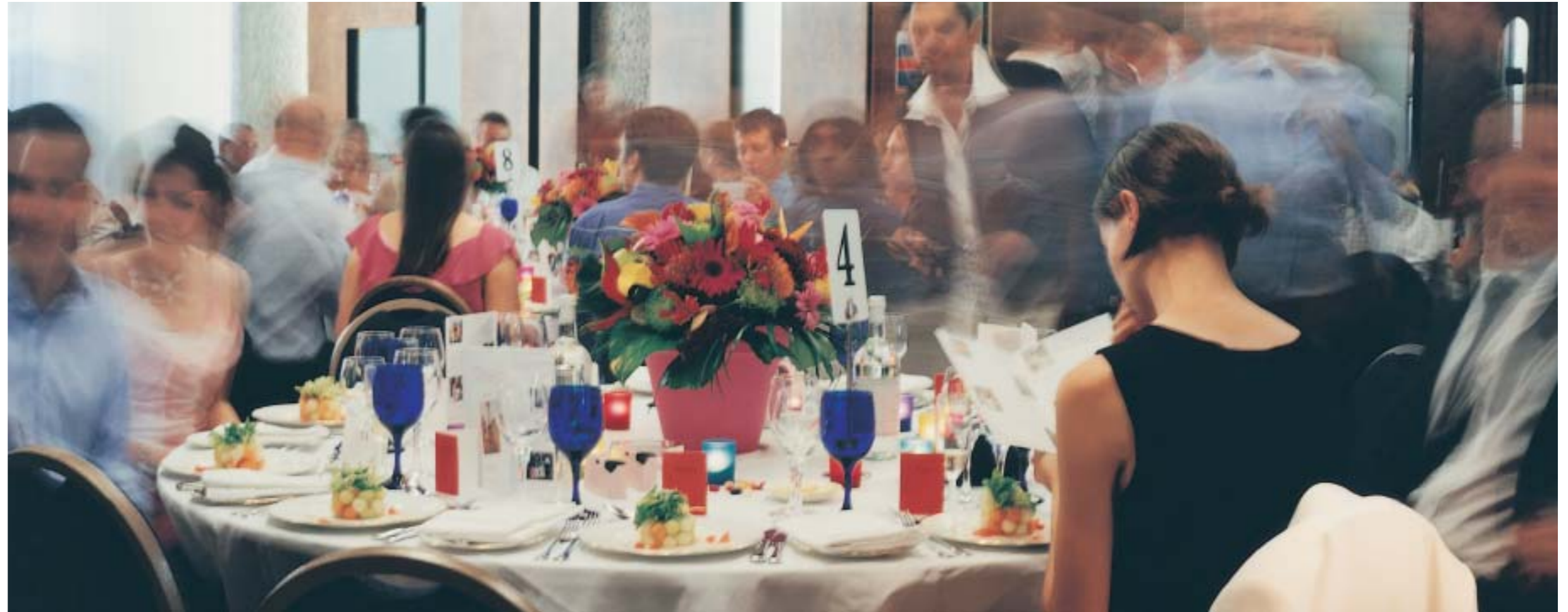
Elegant dining rooms offering wonderful views of the conservatory make a worthy backdrop to any occasion.