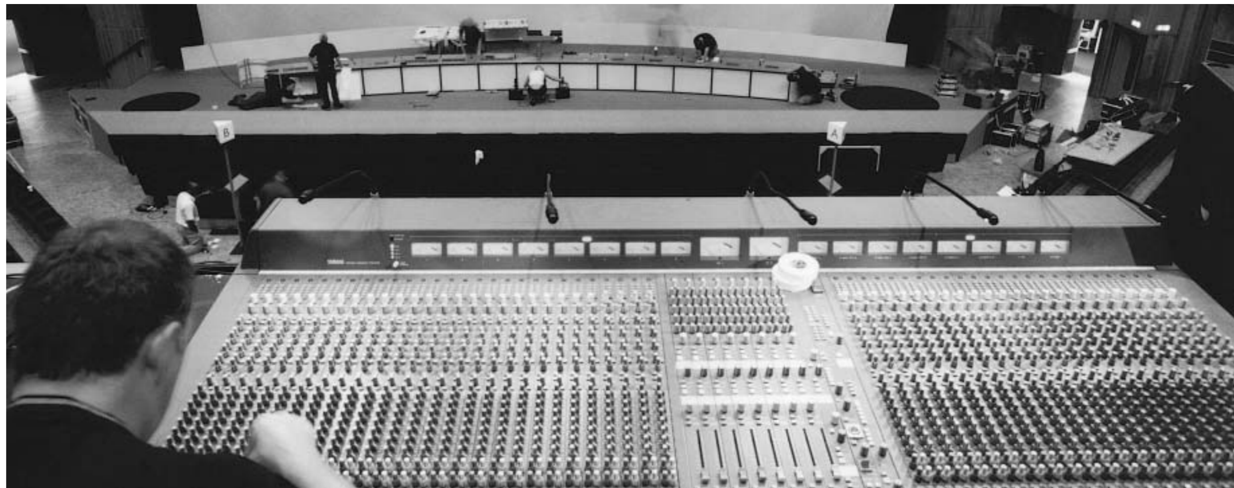
Professional technical support, combined with an extensive range of all-inclusive staging facilities offer unrivalled levels of service in the 1,989 seat Barbican Hall.