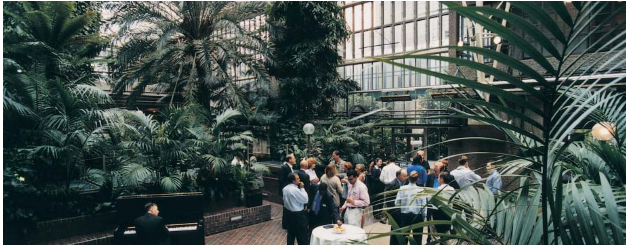
The spectacular Conservatory (a lush tropical oasis that is home to finches, quails, exotic fish and over two thousand species of tropical plants and trees) is a splendid venue for private parties and corporate entertainment.