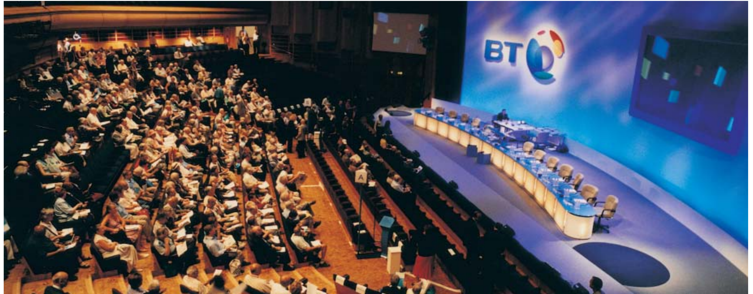
Excellent sight lines, tiered seating and air-conditioning are just some of the features that make Barbican Hall the perfect venue for high profile events.