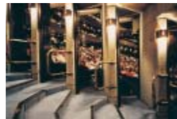
The auditorium has generous leg room and the three circles above the raked stalls overhang one another to achieve an all-embracing relationship between audience and speaker.